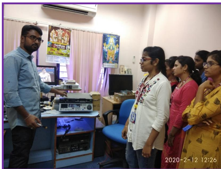
Explaining the activities in Editing Room