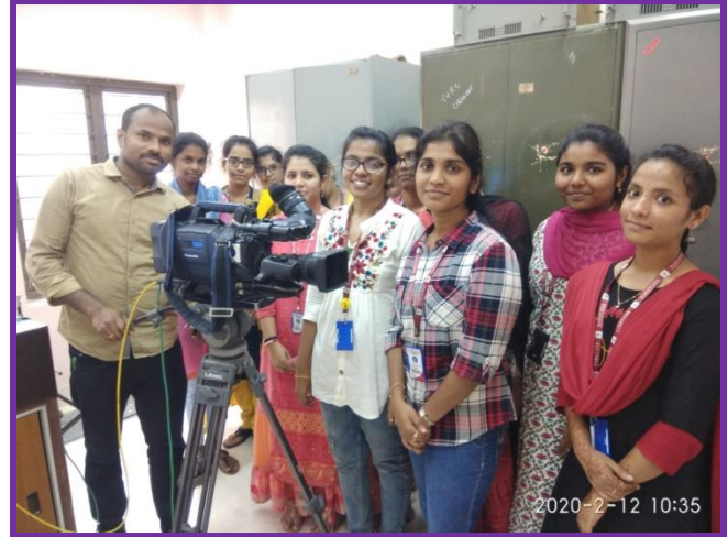
At Electronics News Gathering Room