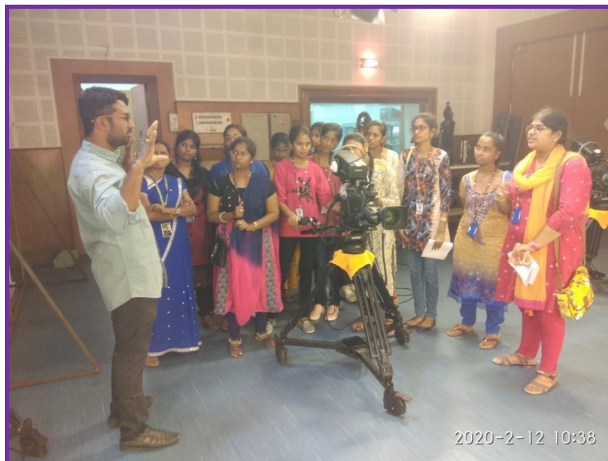
Explaining about the Studio Room

We Industrial coordinators express our sincere thanks to the Management, principal, Vice-Principal and HOD for permitting students for this informative visit.