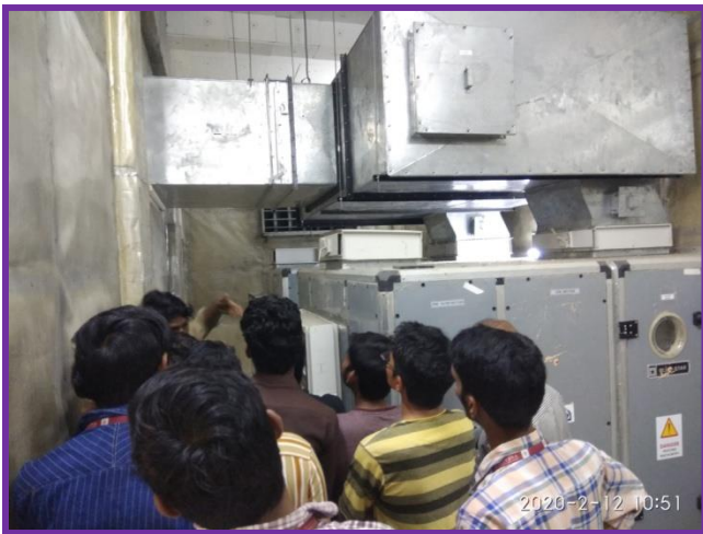
Explaining about the AC Plant