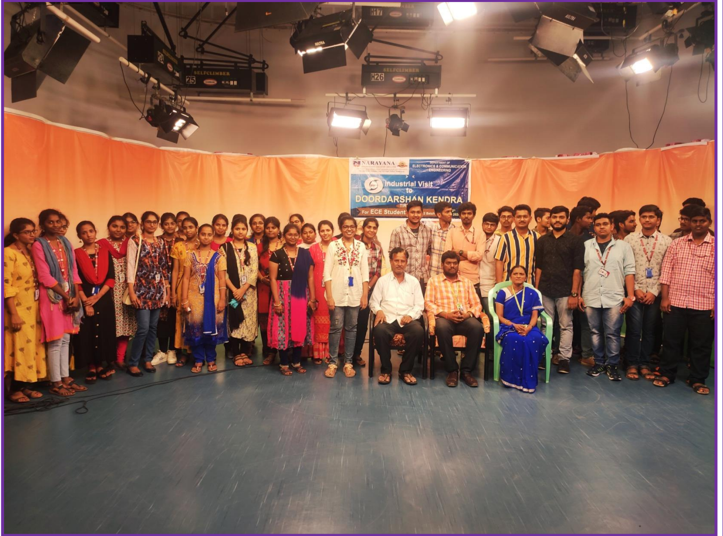
Group Photo with Director of Doordarshan Kendra